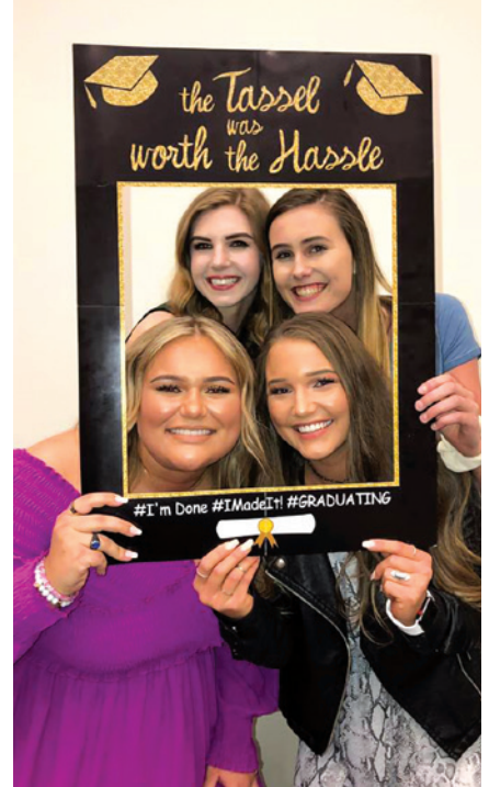
Gilmer High students were all smiles on awards night.