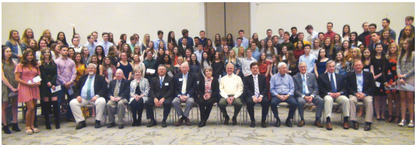
At the Youth Awards Banquet, 133 seniors, shown here with the AEMC Board of Directors, were honored for their achievements.